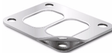
△ Sandwich Type Gasket

The high temperatures and high pressures in the combustion chamber make it the most difficult area to seal. Sandwich Type are mostly used for turbocharger gaskets, exhaust gaskets and cylinder head gaskets, they have two layers of thin metal such as steel, aluminium, or copper with soft middle layer of core material like graphite or non-asbestos.