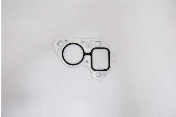
WATER PUMP GASKET