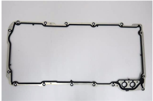
OIL PAN GASKET