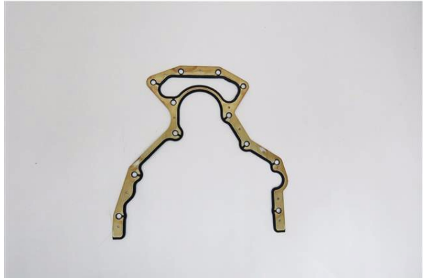
REAR MAIN COVER GASKET

More Products available: www.mj-deyi.com.tw