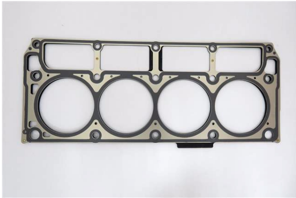
CYLINDER HEAD GASKET